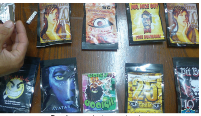
Tempting wrapping to promote poison

Jweihan argues that Jerusalem is being subjected to an unconventional war in which the Israeli occupation is using non-traditional weapons to empty the city and divert its inhabitants to issues other than politics and resistance to occupation. He stated that there are 15,000 to 20,000 drug users in the East Jerusalem population, including six thousand who are addicts and whose lives are being destroyed by drugs.